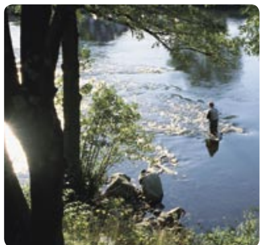
Ätran's Salmon Fishing, one of Sweden's finest. There are several rivers and lakes full of fish.

Art has been given a prominent role. Not the least Sculptura shows the venture to display art and installations of all kinds.