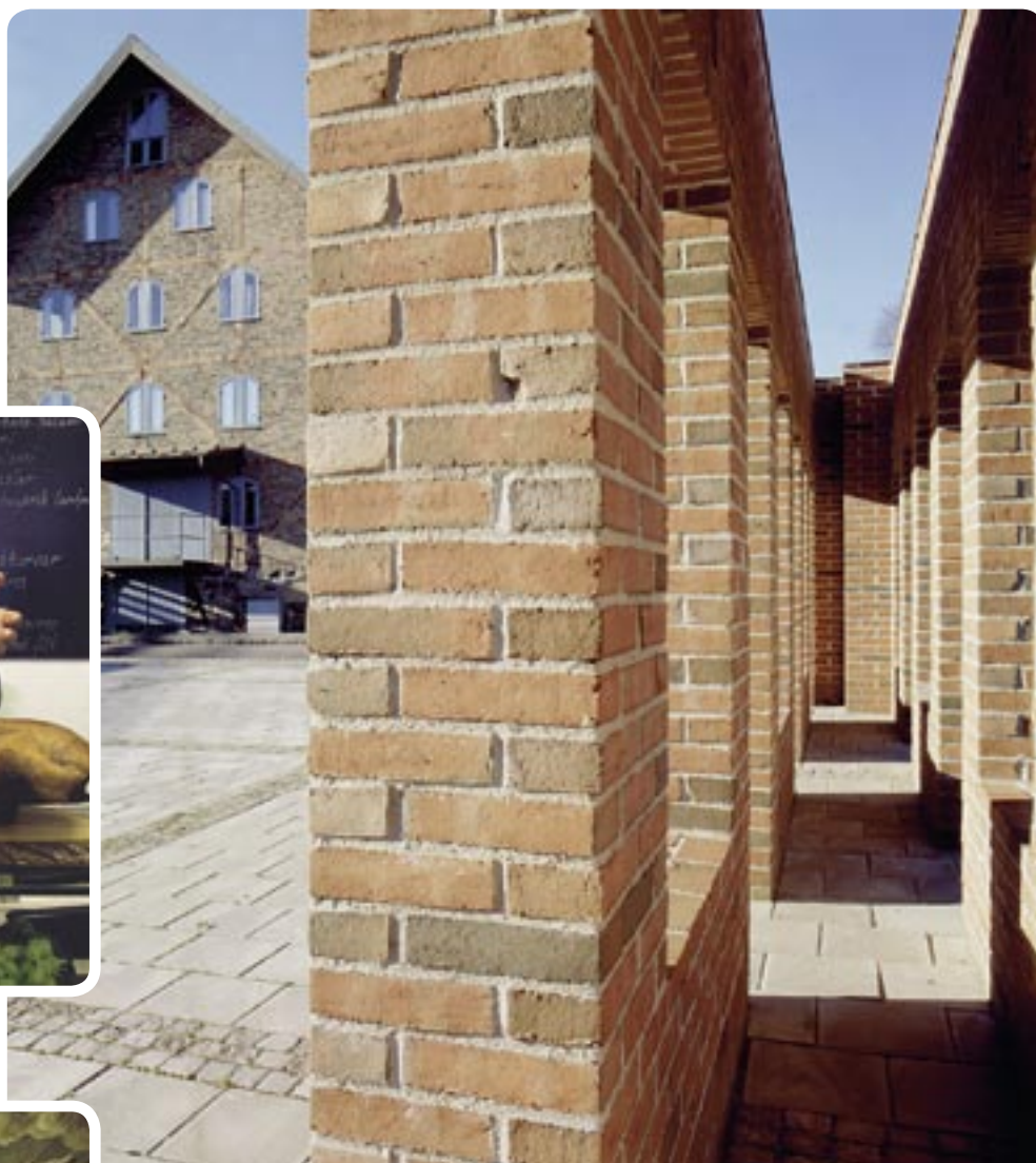
Falkenberg's Museum displays the city's growth during the last 100 years. Per Kirkeby's work of art outside the museum.