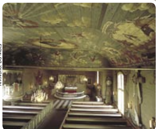
Gunnarps church is included in the Ekomuseum.

In Falkenberg blooms a great cultural life. Few communities in Sweden can compete with Falkenberg in terms of number of museums per capita. The largest is Falkenberg Museum which is located in an old grain shed down by the harbor. Other interesting museums are for example the Photo Museum Olympia, Svedino's Auto and Airplane Museum, Berte Museum (Life on the countryside), the Country Store Museum and the Comic Museum.