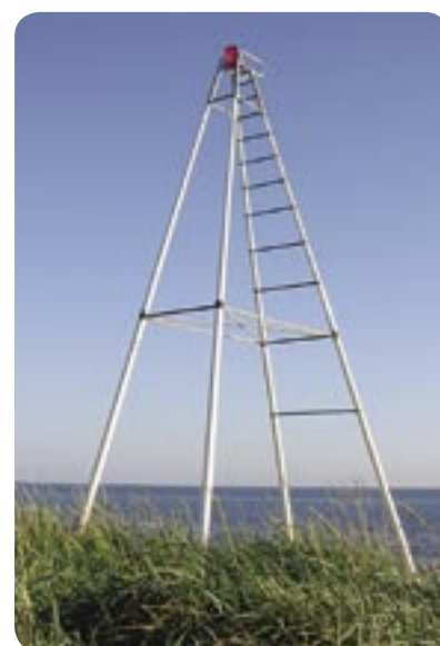
The life guard's chair – one of the installations from Sculptura 02.