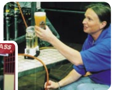
Carlsberg Sweden with the world famous beer Falcon.