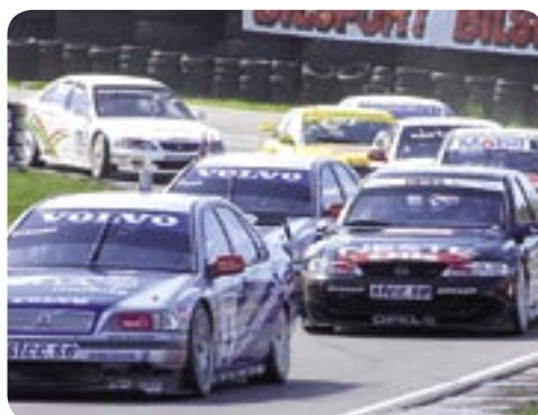
STCC and the West Coast Race at Falkenberg's race track.