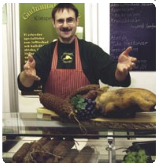
Gudmundsgården Meat Specialties are included in the Ekomuseum.

Ekomuseum Nedre Ätrådalen is the collection name for more than 70 sights worth seeing in Falkenberg's tourist area. The sights cover everything from beautiful nature and cultural settings to craftsmen and today's business life.