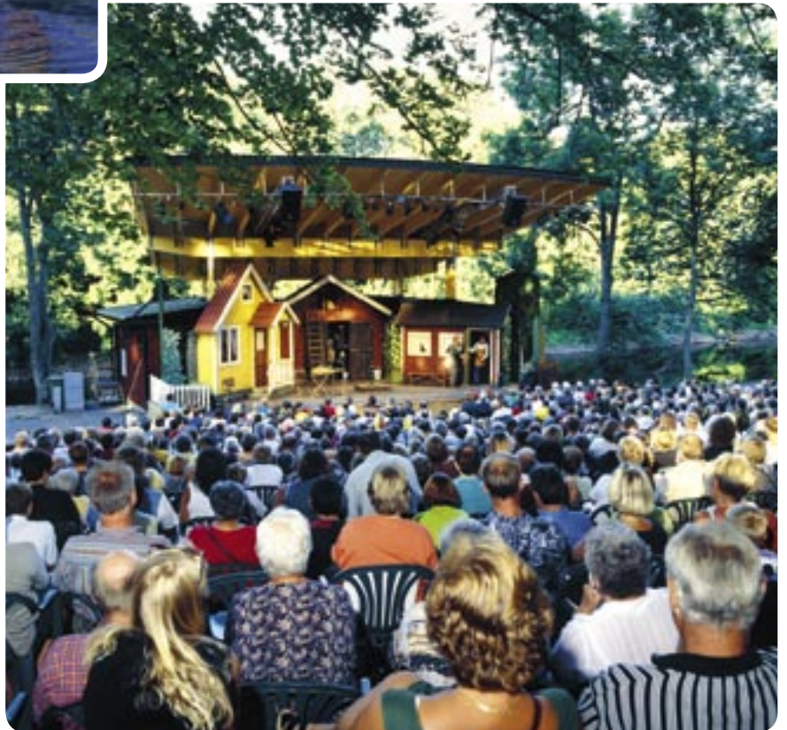
Vallarnas Open-Air Theater with its beautiful location in nature by the Ätran. The summer farce is the biggest summer event in Falkenberg. Sing-along evenings are also organized here during the summers.

These days Falkenberg is an entertainment center all year around. Hundred thousands of people travel here for example to see the summer farce at Vallarnas Open-Air Theater or the Falkenberg Show, to visit the Song Festival or the Jazz Days in Hwitans Garden, to divert themselves at the crayfish festival in Glommen, to watch the STCC motor races or to visit another of hundreds events that are organized around the community.