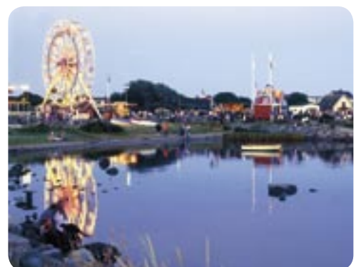
The Crayfish Festival in Glommen. During five days you enjoy the delicacies of the ocean.