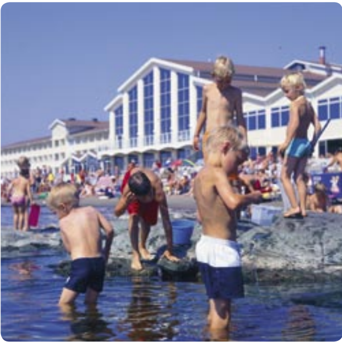
Skrea beach with the longest swimming dock on the west coast. Elite Hotel Strandbaden – a first class tourist and conference hotel.

We are especially proud of the great variety of events, entertainment and activities that we have. Everything Falkenberg has to offer is provided full of joy and pride.