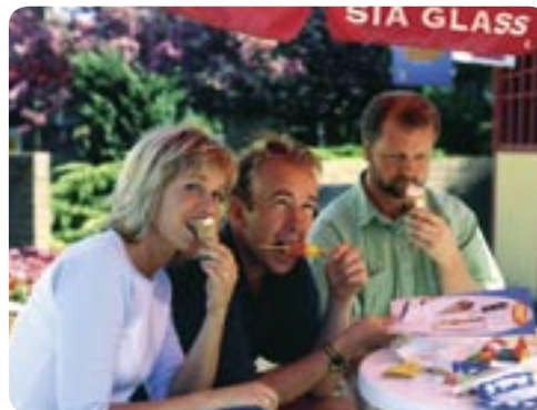
Even our famous comedians enjoy SIA Ice Cream.